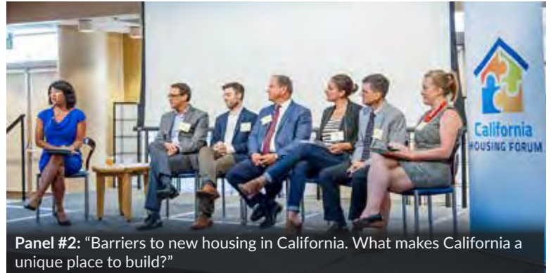
Panel #2: "Barriers to new housing in California. What makes California a unique place to build?"