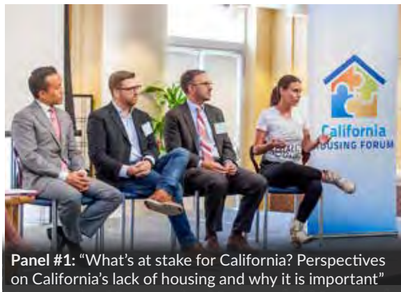
Panel #1: "What's at stake for California? Perspectives on California's lack of housing and why it is important"